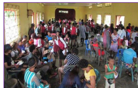
Cross section of graduating girls, GPI staff and facilitators, Medical team and Community members during 2019 Social Intervention