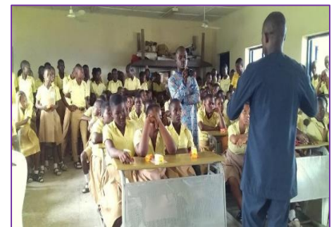
GPI Facilitator giving information on Sexual Health to students of Big-Quo Girls School.

The Cross River NETCUSA outreach programme to NYSC Secondary School in May and Big Quo girls Secondary School 14 June 2019. Students were given useful information on issues of sexual abuse and rape, how to get help. A long session for questions and answers was taken to address issues bothering students.