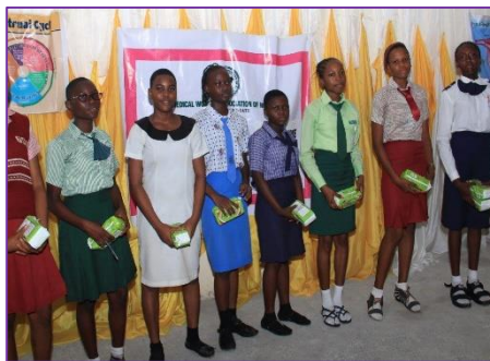
Menstrual Hygiene Day celebration

GPI joined global partners other state NGOs, government agencies and the private sector to promote safe and effective menstrual hygiene management on the menstrual hygiene day held in May 2019. Highlights of the activities included; sanitization talk to girls, how to maintain proper hygiene during menstruation, demonstration on how to use and dispose sanitary pads properly and distribution of sanitary pads to girls.