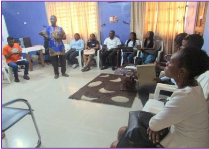
NETCUSA Members briefing during GBV Center

NETCUSA paid a curtesy visit to the Gender Based Violence (GBV) Center at the Ministry of Women Affairs, Calabar. The aim of the visit was to access the facility, know what services they offer, the areas of need and offer possible solutions, propose ways to increase the visibility of the center, identify which area volunteers are needed and also discussion on how they can both work in synergy.