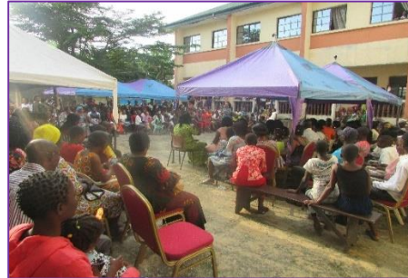
A Cross Section of Participants in the Parents Wards Forum on the Int'l Day of African Child.

as part of activities to mark the 2019 Day of the African child, which is celebrated regionally to draw attention to the plight of African children and explore solutions. The event was aimed at strengthening the public speaking skills of the beneficiaries for advocacy efforts especially on issues of gender, Adolescent Reproductive Health and Rights, Violence and Human Rights in general.