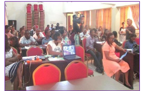
Cross section of participants during the Advocacy Plan Implementation and Evaluation Meeting.

GPI Calabar in collaboration with the Cross River Network to Curb Sexual Abuse (NETCUSA) organized a 2-day advocacy plan implementation and evaluation meeting on May 15th to 16th, 2019. The objective of the meeting was to evaluate NETCUSA, the journey and success of the campaign, training programs, share implementation challenges, developed a sustainability plan and advocacy tool/work plan and advocacy messages on sexual abuse for NETCUSA to influence a changed and supportive attitude and response to issues of sexual abuse of girls and young females.