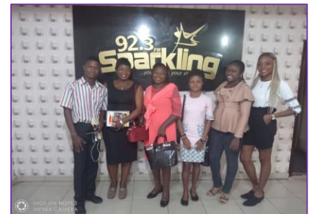
Cross Section of presenters at the Radio Station.

A live radio programme GPI on Air at Sparkling 92.3 FM by 10:30 am every Wednesday. Topics discussed from May to June were smuggling of migrants and human trafficking, violence against children, contraceptives and today's youth, managing depression in young people, influence of peer group on young people, drugs and substance abuse. The listeners of GPI on Air call to ask questions while some of them sent text messages to get clarifications of the information shared during the program.