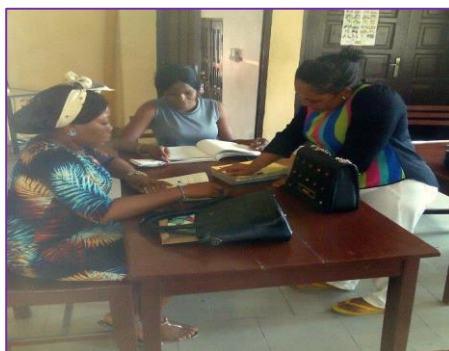
The Librarian attending to Library users