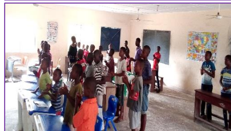
Section of the girls/boys in Sunday lessons