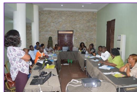
Advocacy Message Development Session

The 3 days message development and adaptation for child protection workshop in Cross River State organized by UNICEF in collaboration with USAID for relevant stakeholders including GPI Calabar, to develop and adapt messages for child protection. The objective of the workshop was to develop key messages for posters, radio jingles and billboards to end: violence against children in schools, child marriage, witchcraft branding and sexual abuse.