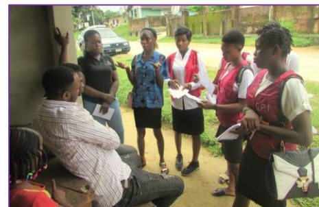
Graduating girls engaging with community members during Needs Assessment.

This year, the community chosen was Ilang in Bakassi Local Government Area, Cross River State.