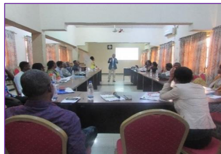
YESSO stepdown training for enumerators.

Girls' Power Initiative (GPI) Calabar center as an implementing partner for the Establishment/Expansion of single register of poor and vulnerable households in two LGAs in the southern senatorial district of Cross River State, organized a stepdown training for enumerators of the Single Register.